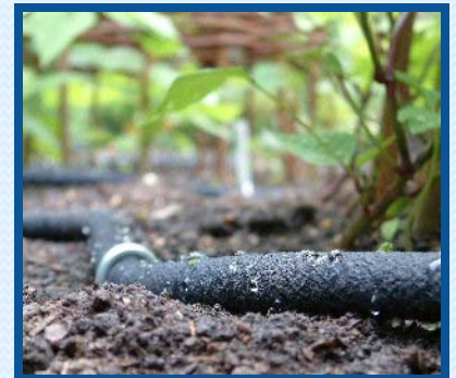
soaker hose or drip irrigation

http://www.conservewater. utah.gov/outdooruse/ otherplants/.