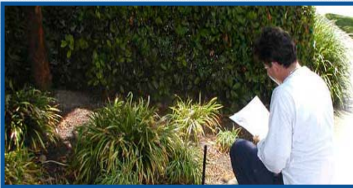
Conducting an irrigation audit